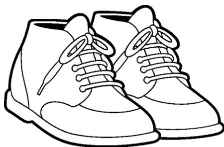
a pair of shoes